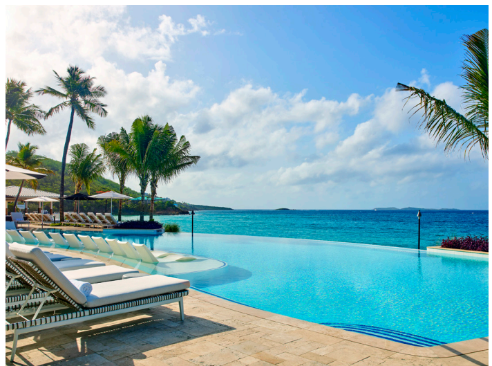
BUOY HAUS BEACH RESORT, AUTOGRAPH COLLECTION, ST. THOMAS