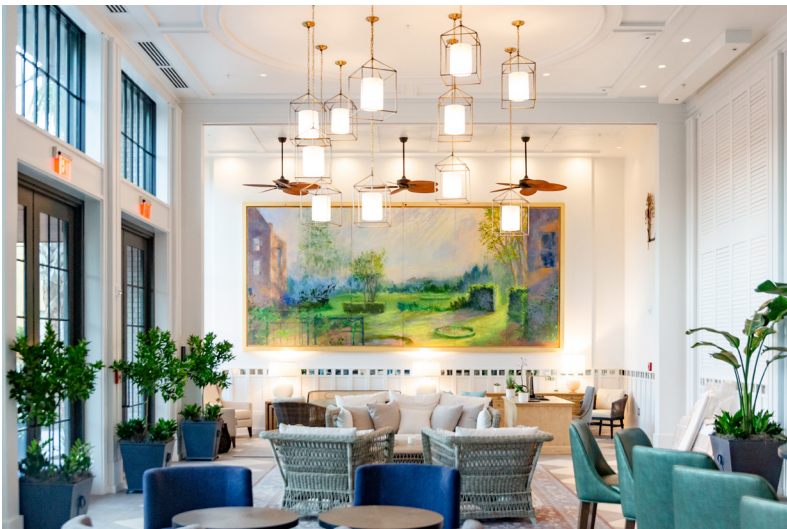
THE LOUREL HOTEL | CHARLESTON, SOUTH CAROLINA

An award-winning global practice, the work of Michael Graves represents a legacy of imagination and problem-solving. At all scales and for all users, we draw on our craft to create solutions that are both pragmatic and transformative. We design for life. We connect people, create inspiring places, and build memorable experiences. We stand out because our work is a consequence of continuous learning, listening to our clients, and aiming to deliver the highest possible level of service. We strive to make your vision timeless, while promoting environmental stewardship, quality, and adaptability, with cost-effective solutions.