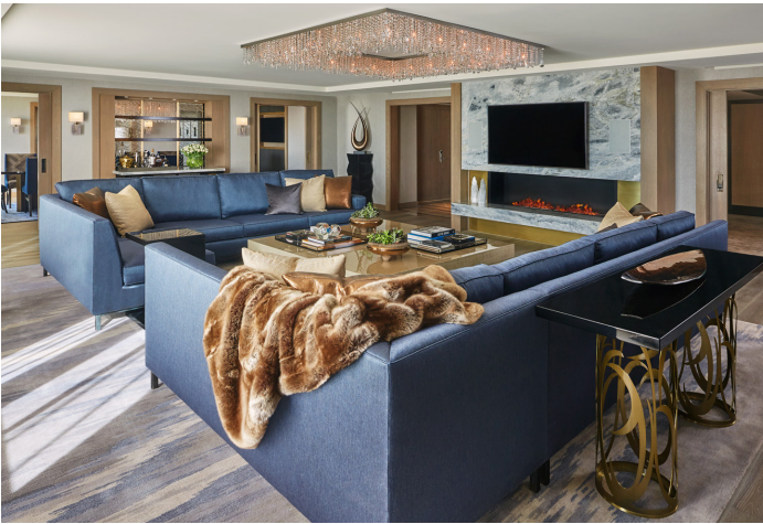
L'ERMITAGE HOTEL | BEVERLY HILLS, CALIFORNIA