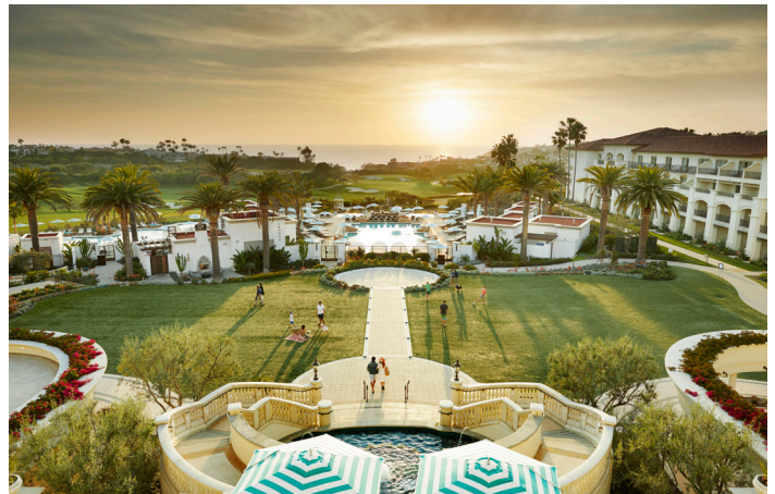
WALDORF ASTORIA MONARCH BEACH RESORT | DANA POINT, CALIFORNIA