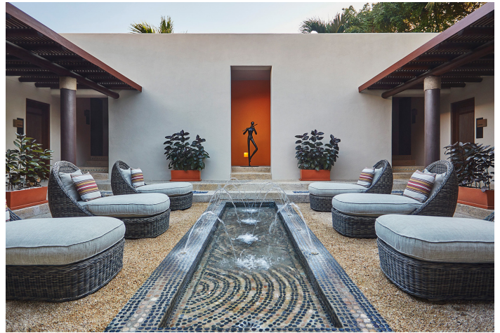
FOUR SEASONS RESORT PUNTA MITA | NAYARIT, MEXICO