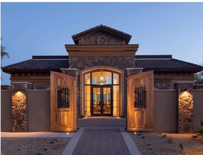
PRIVADO VILLAS AT THE FAIRMONT SCOTTSDALE PRINCESS | ARIZONA