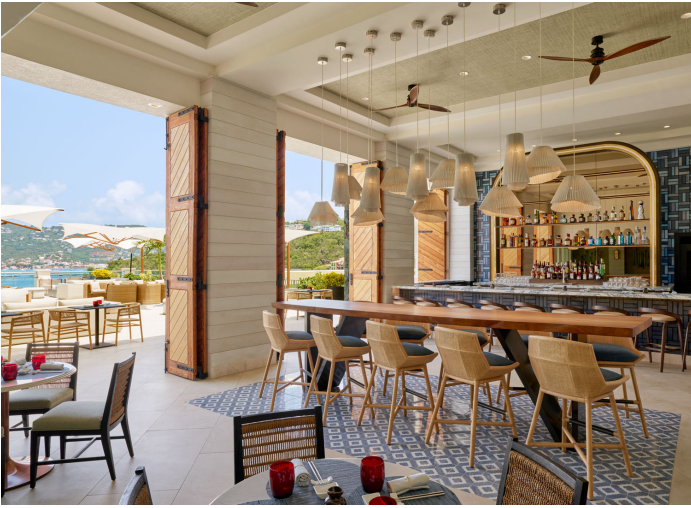
WESTIN BEACH RESORT & SPA AT FRENCHMAN'S REEF | ST. THOMAS, USVI