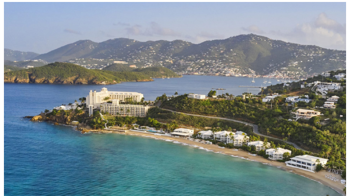
WESTIN BEACH RESORT & SPA & BUOY HAUS BEACH RESORT, AUTOGRAPH COLLECTION AT FRENCHMAN'S REEF | ST. THOMAS, U.S. VIRGIN ISLANDS

Michael Graves Architecture (MG) is a full-service, award-winning architecture, planning and interior design firm based in Princeton, New Jersey, with 10 offices across the U.S. Founded in 1964 by AIA Gold Medalist Michael Graves, the firm brings iconic design vision to projects of all scales around the globe. With a specialization in hospitality and leisure design, MG has designed projects of many different types throughout the world and has won the most prestigious awards. From large-scale master plans and buildings to the fine details of interiors and their furnishings, our work is always inspired by the physical and cultural context and the people who commission it, create it, and ultimately live in it.