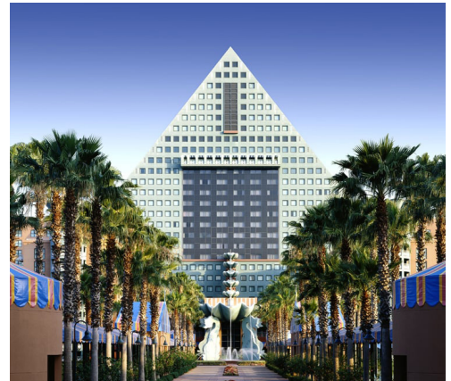
Walt Disney World Swan & Dolphin Hotels Lake Buena Vista, FL