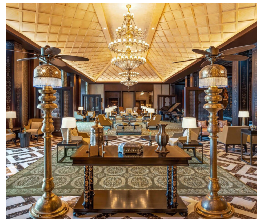
St. Regis Cairo at the Nile Corniche, Egypt