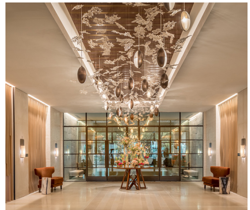
Four Seasons Hotel, Austin, TX