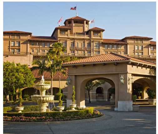
The Langham Hotel, Pasadena, CA