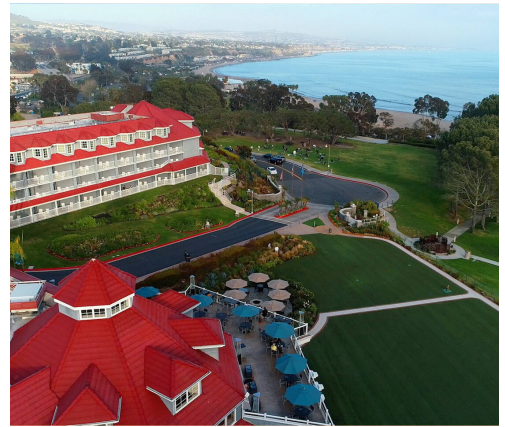
Laguna Cliffs Marriott Resort, Dana Point, CA