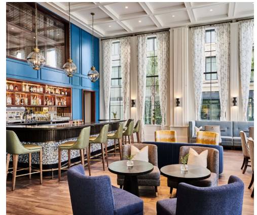
The Loutrel, Charleston, SC