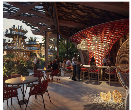
The Beach Club, Caribbean