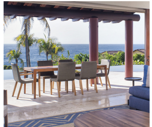
Four Seasons Resort, Punta Mita, Mexico