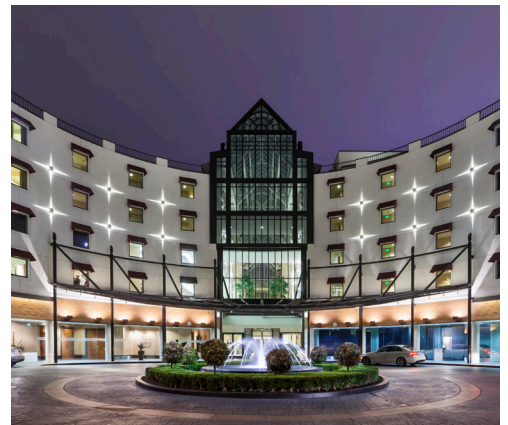
Loews Santa Monica Beach Hotel, CA