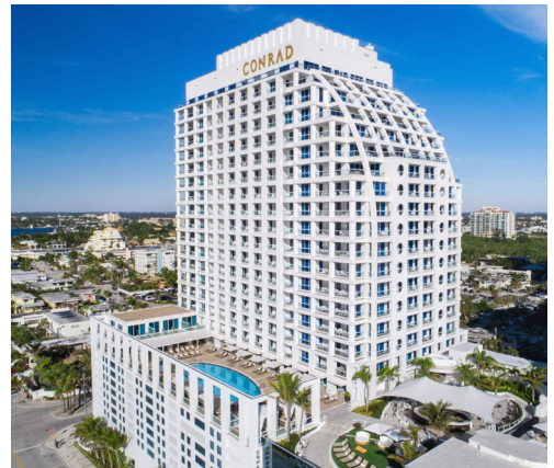
The Conrad Hotel, Fort Lauderdale, FL

Fairmont Chicago Hotel - Chicago, IL • Guestroom renovations