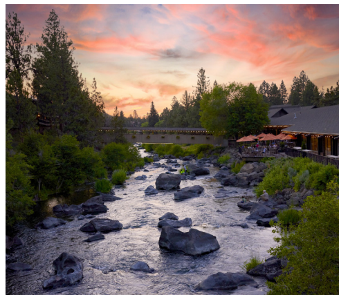
Riverhouse Lodge, Bend, OR