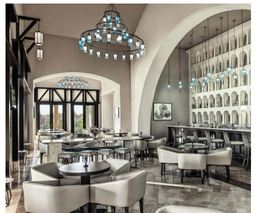
Sheraton Miramar Hotel & Resort, El Gouna