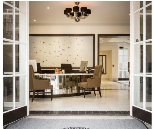
Mosaic Hotel, Beverly Hills, CA