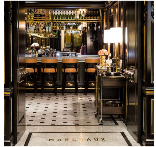
Waldorf Astoria Hotel & Spa, Chicago, IL