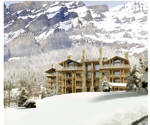
51 Degrees Spa Resort, Switzerland