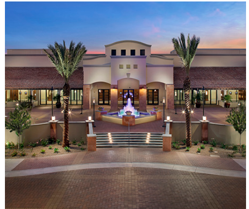
Fairmont Scottsdale Princess, AZ