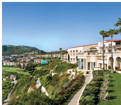
The Ritz-Carlton, Laguna Niguel Dana Point, CA