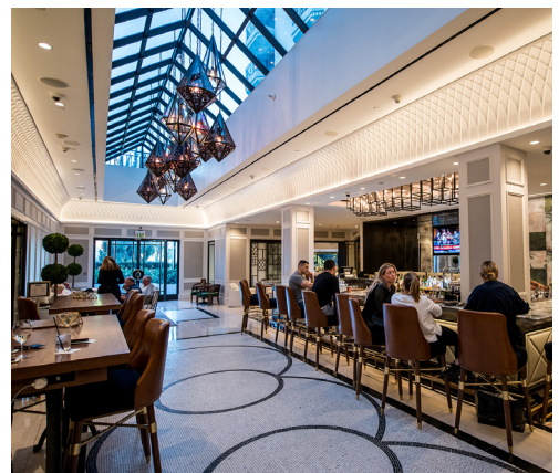
London West Hollywood, Beverly Hills, CA