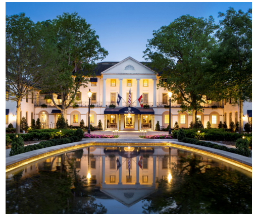
Williamsburg Inn, Williamsburg, VA