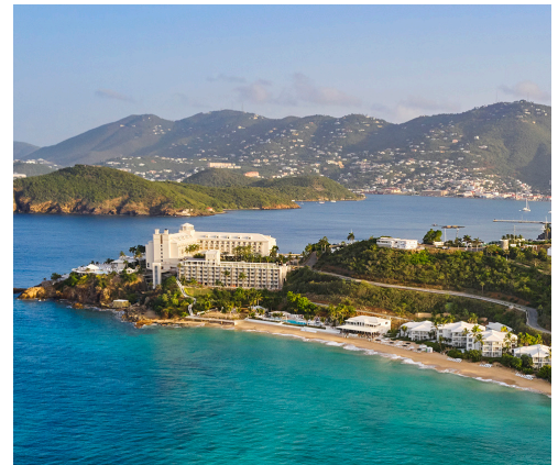
The Westin Beach Resort at Frenchman's Reef St. Thomas, USVI