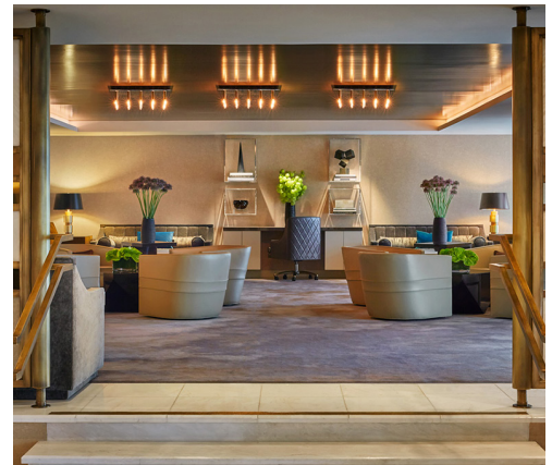
L'Ermitage Hotel, Beverly Hills, CA