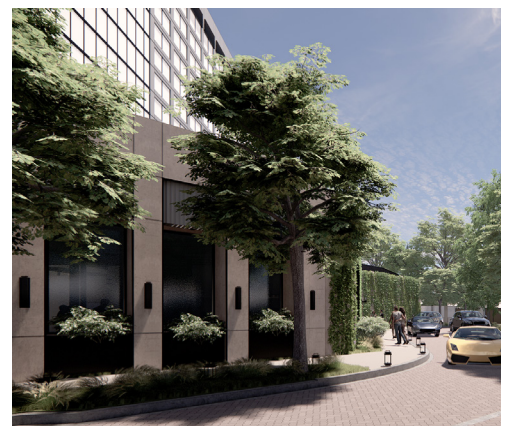
Hotel Derek (the Greenleigh), Houston, TX