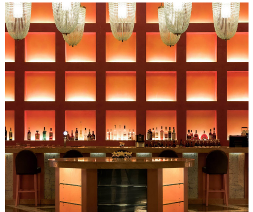
Hotel Michael, Resorts World Sentosa, Singapore