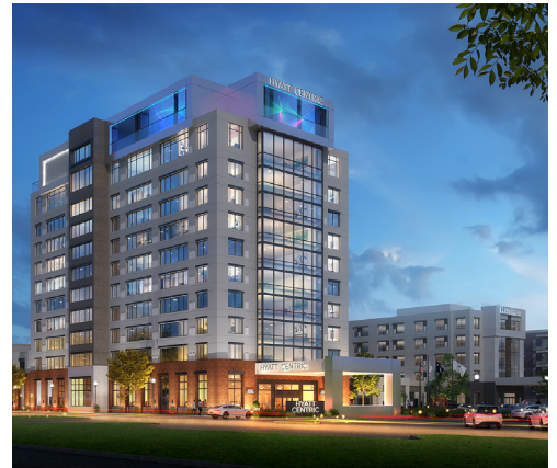
Hyatt Centric & Hyatt House, Columbia, SC