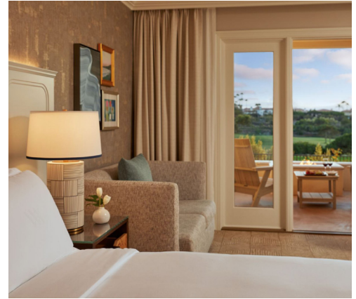
Waldorf Astoria Monarch Beach Dana Point, CA