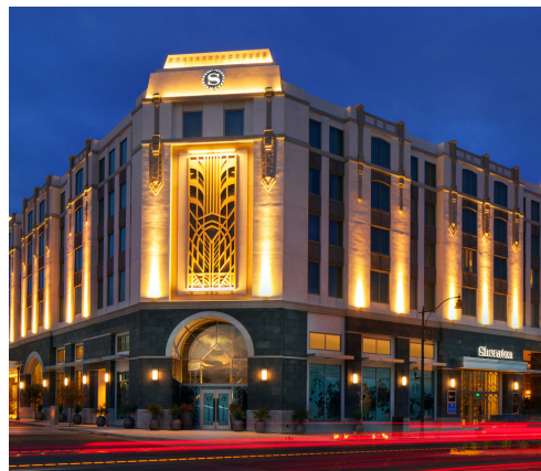
Sheraton Los Angeles, San Gabriel, CA