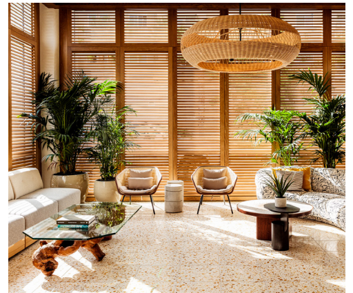
Hotel June, Los Angeles, CA