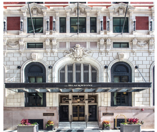
The Blackstone Hotel, Chicago, IL