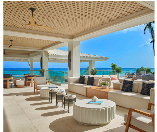
Morningstar Buoy Haus Beach Resort Frenchman's Reef, St. Thomas, USVI