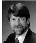
by Jon Inge

BLENDING THE RIGHT TECHNOLOGY INGREDIENTS FOR THE PERFECT MIX OF GUEST SATISFACTION AND PROFITS